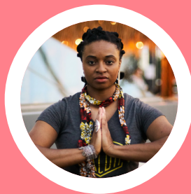
DJ LIKWUID @likwuid